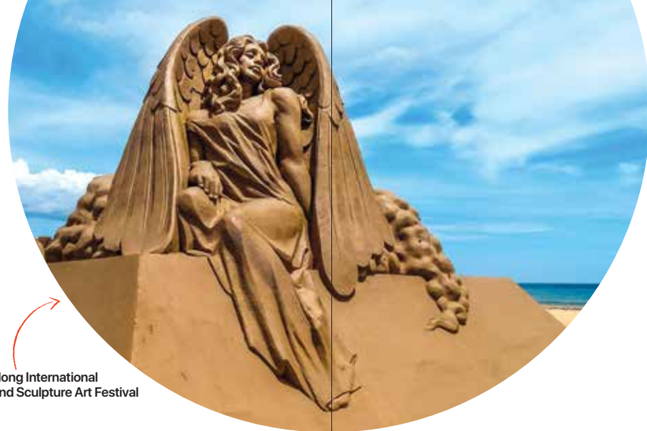
Fulong International Sand Sculpture Art Festival

Festivals reflect the spirit of a country and its people. Festivals bring merriment and joy, create memories and offer a reason to celebrate life in any form. Like India is a land of festivals, Taiwan is abuzz with festivals all year long and people rejoice and come together to participate in the celebrations. We bring to you the top 10 festivals of Taiwan to check out!