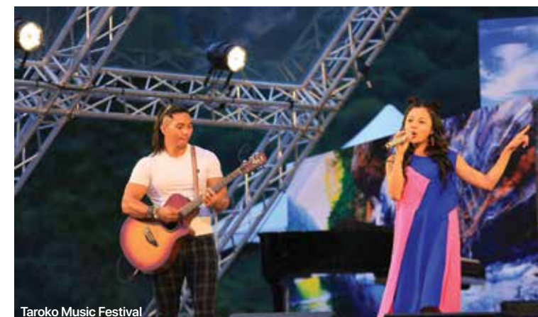
Taroko Music Festival

Yuchi, Nantou County sunmoonlake.gov.tw/en