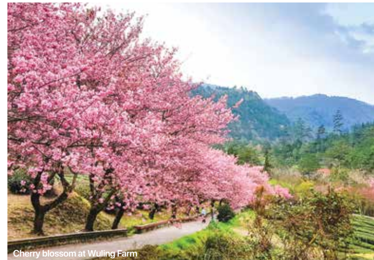
Cherry blossom at Wuling Farm

People visiting Taiwan don't want to miss out on the spectacular Cherry blossoms during the spring season each year. This natural wonder attracts about half a million visitors year on year and offers picturesque sceneries all around. Popular places for sighting Cherry blossoms are Yangmingshan National Park and Chiang Kai-Shek Memorial Hall in Taipei city. The cherry trees are decorated with special lights and in the evening you can enjoy a relaxing walk in the park. The Sun Moon Lake, Formosan Aboriginal Culture Village and Wuling Farm near Taichung City are the biggest attractions with thousands of blossoming cherry trees including varieties such as Yaezakura and Oshima trees. Alishan Mountain in Chiayi County offers the most extravagant sight of cherry blossoms with over 19,000 blooming trees. Worth making time for this.