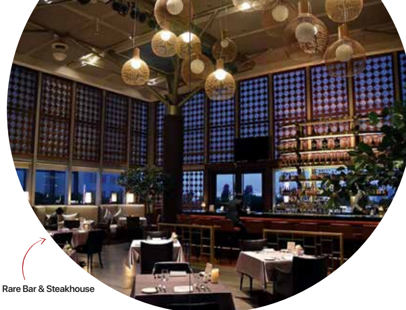
Rare Bar & Steakhouse

This trendy rooftop bar is the place to go for vibes and atmosphere, but also one of the best places for fantastic