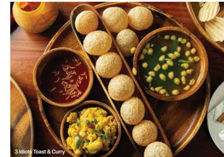
3 Idiots Toast & Curry

○ Mon-Fri: 11:30-15:00/17:00-22:00; Sat-Sun 11:30-22:00 ○ No. 28, Lane 283, Section 3, Roosevelt Road, Taipei 106, Taiwan +886 2 2369 9966 facebook.com/Currytoast