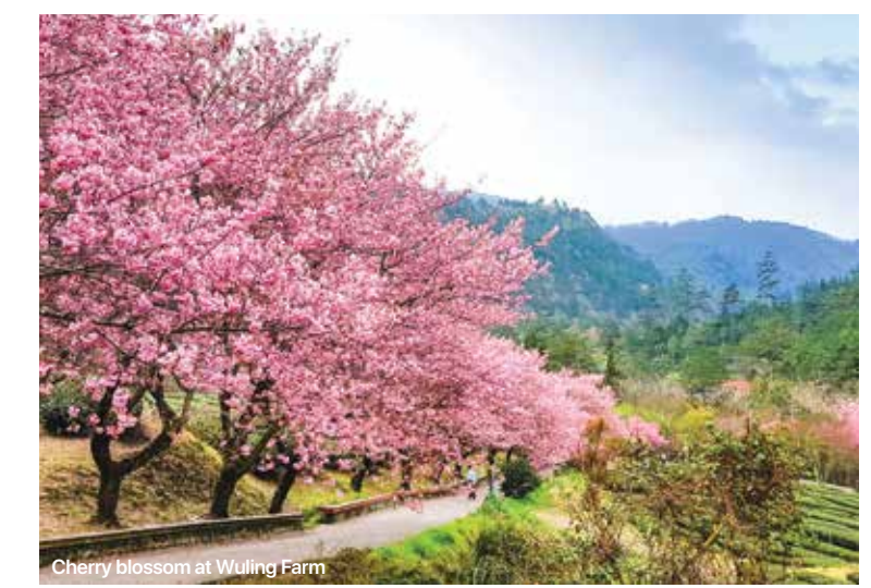
Cherry blossom at Wuling Farm

People visiting Taiwan don't want to miss out on the spectacular Cherry blossoms during the spring season each year. This natural wonder attracts about half a million visitors year on year and offers picturesque sceneries all around. Popular places for sighting Cherry blossoms are Yangmingshan National Park and Chiang Kai-Shek Memorial Hall in Taipei city. The cherry trees are decorated with special lights and in the evening you can enjoy a relaxing walk in the park. The Sun Moon Lake, Formosan Aboriginal Culture Village and Wuling Farm near Taichung City are the biggest attractions with thousands of blossoming cherry trees including varieties such as Yaezakura and Oshima trees. Alishan Mountain in Chiayi County offers the most extravagant sight of cherry blossoms with over 19,000 blooming trees. Worth making time for this.