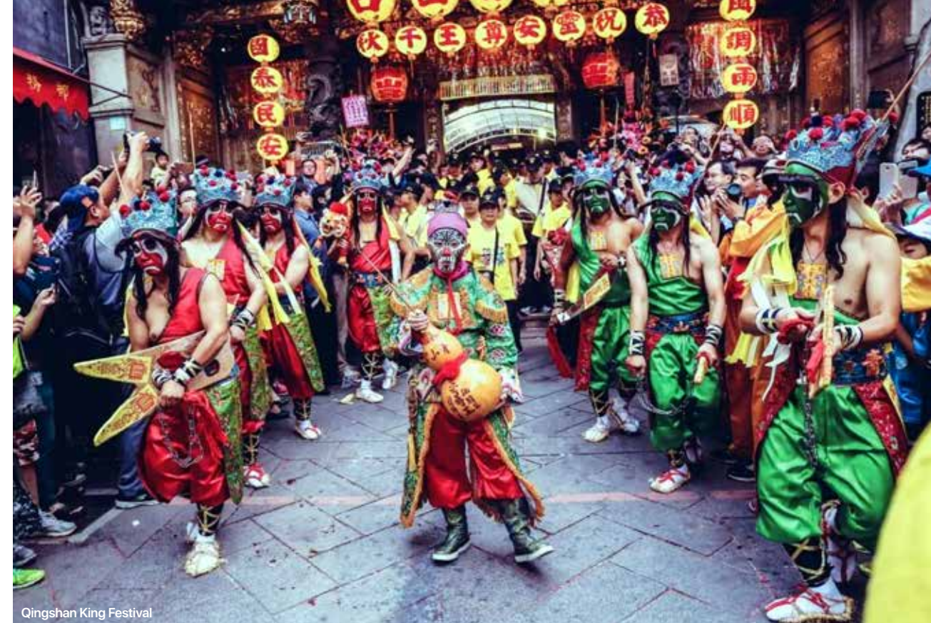
Qingshan King Festival

Every year the Confucius Temple at Taipei witnesses thousands of people thronging its premises to commemorate the birthday of the grand master Confucius. The ceremony takes place at 6am on 28 September annually. This ritual has been carried forward by the temple for the past eight decades. The well-preserved Confucian ceremony