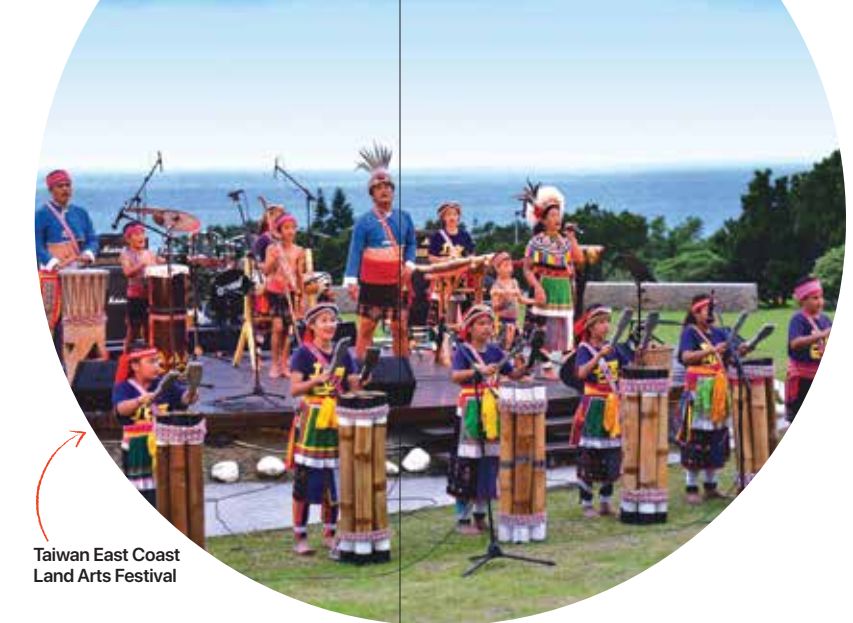
Taiwan East Coast Land Arts Festival

Trees covering the mountains and fields used to be an important cash crop for the Hakka tribe. These trees were widely planted and have been associated with economic activity as well. The Hakka tribe people express their gratitude and feelings towards the Tung tree, the mountains, and nature in general through this festival. When they blossom, the white flowers entice people for spending time with nature and witness the true culture of the Hakka tribe.