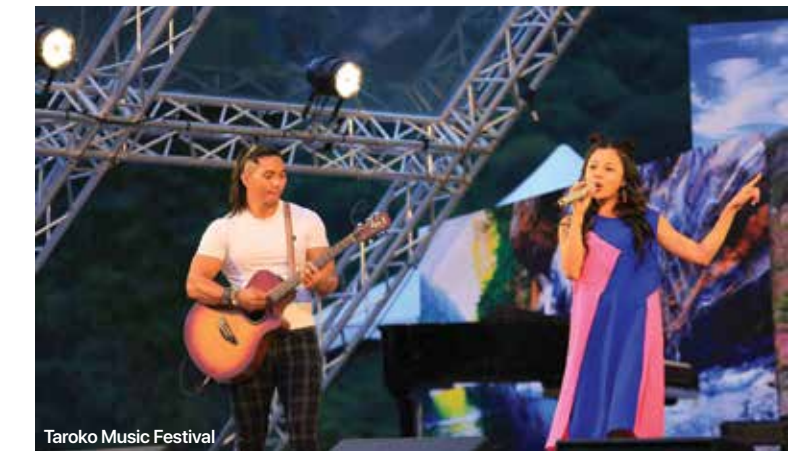
Taroko Music Festival